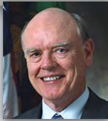
Treasury Secretary John W. Snow