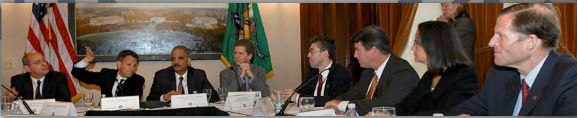
Cabinet level anti-fraud in housing market discussions